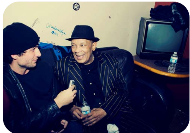
Interview with Roy Ayers